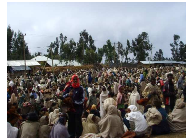
Emerging City as centre of market for the rural hinterland