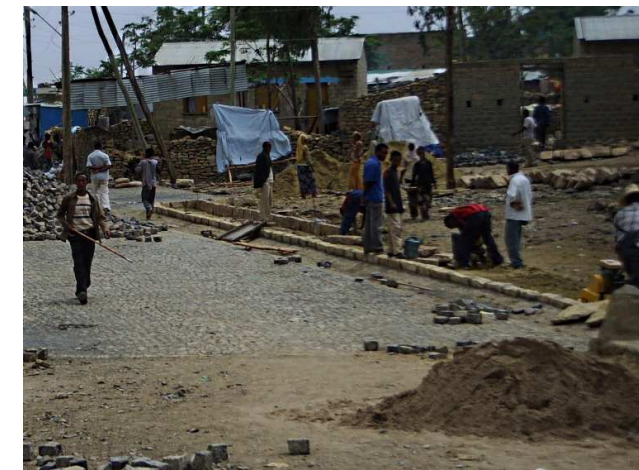
Absorption of job seekers in urban development projects: Unskilled workers on the cobblestone road construction side